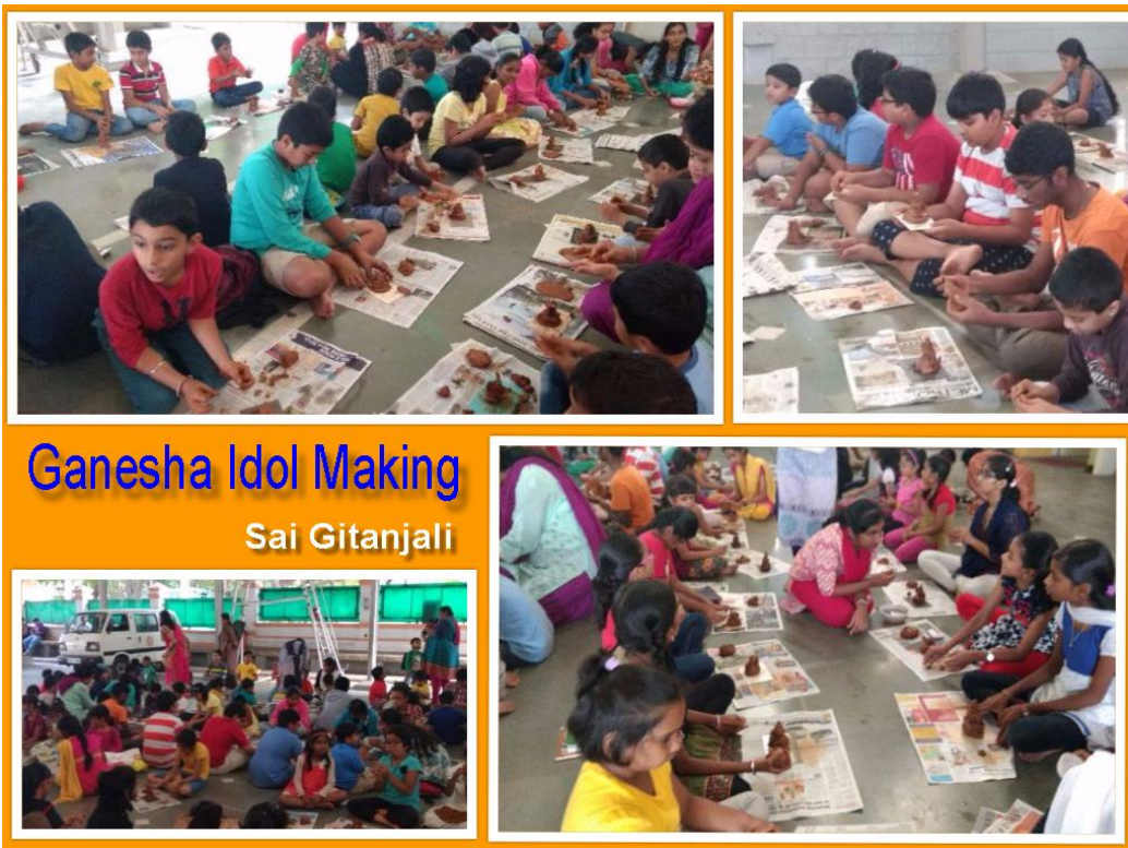
Ganesha Idol Making Sai Gitanjali

The annexe area of SAI GITANJALI wore a festive look with all the children seated in rows, helping one another and learning the craft of Ganesha making! 75 children of all age groups participated and carried home their own Ganesha for Pooja.