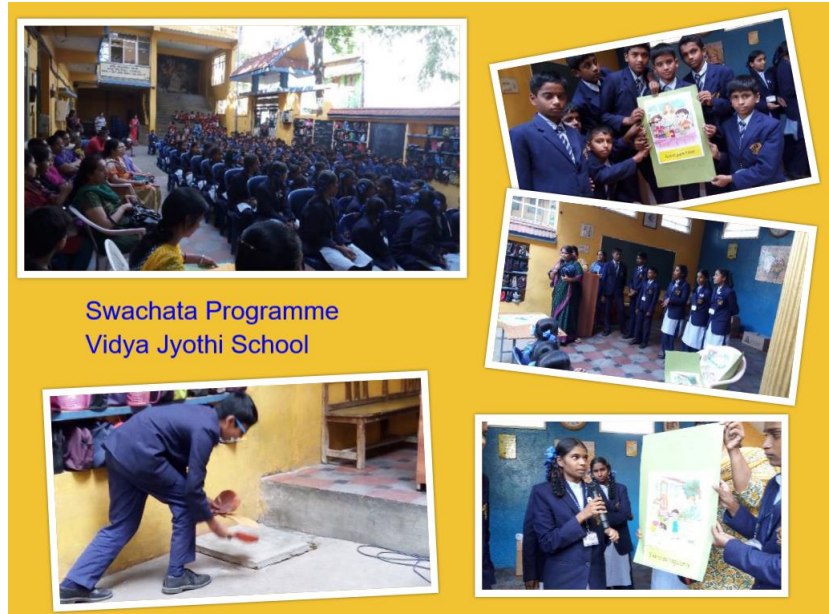
Swachata Programme Vidya Jyothi School

As a token of appreciation, the school was gifted a nice wall clock with Swami's photo, which now adorns their office room.