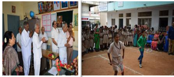
SSSVJ Programme at NSVK Kannada Primary School