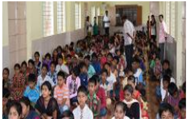
SSSVJ Programme at Sri Sangameshwara School